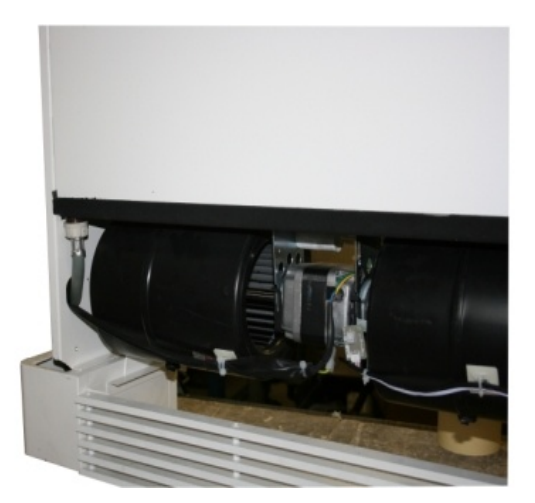
5 Connect power and remote humidostat wires.